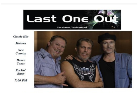
Saturday, April 29th @ Midland Eagles Club

One of our Club's favorites, Last One Out will be returning April 29 at 7pm. They play Classic Hits, Motown, New Country, Dance Tunes, and Rockin' Blues. Come on out and join the fun!